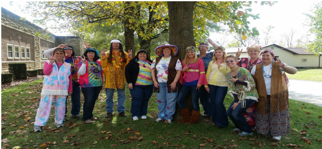
Holy Cross Teachers and Staff dressed like 70's Flower Children on Halloween