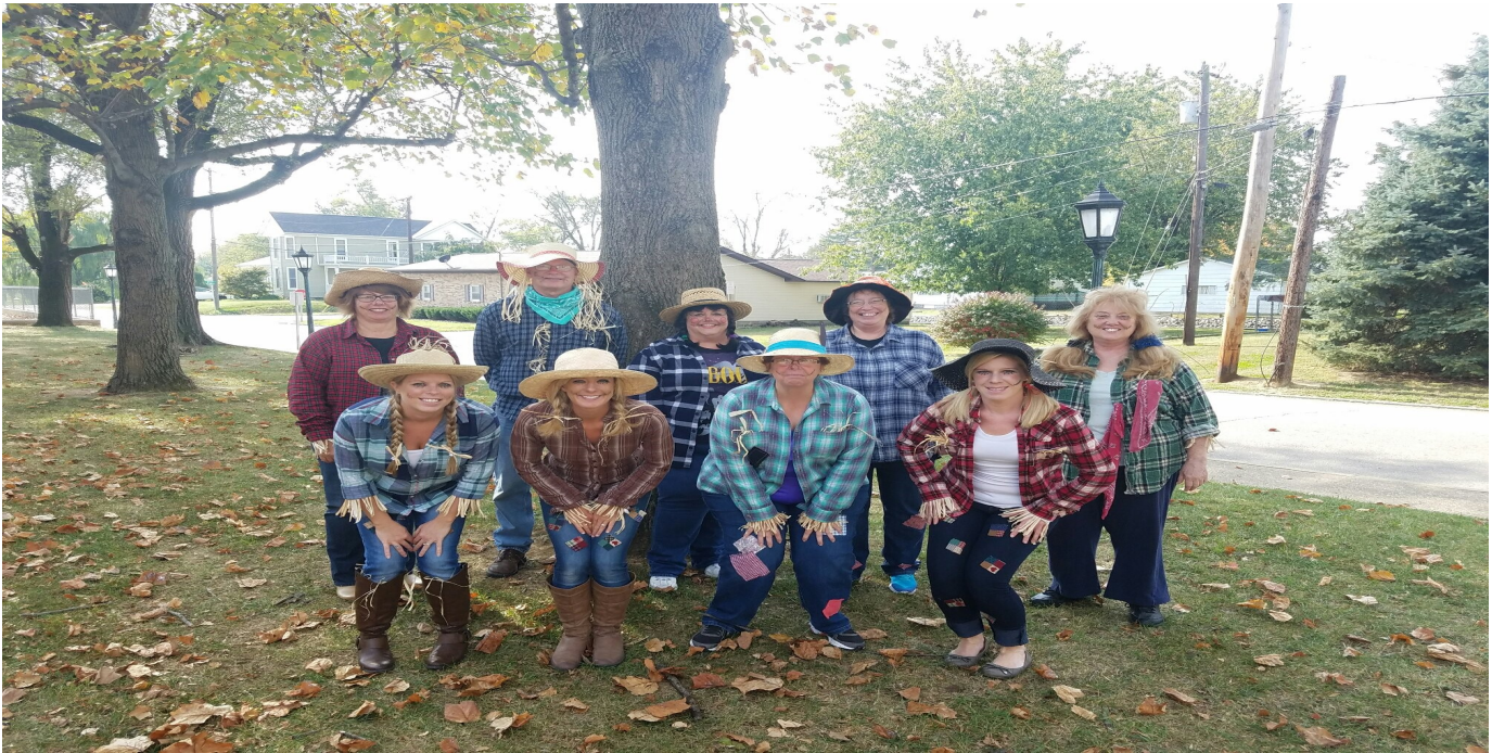
The Holy Cross Staff dressed as scarecrows for Halloween.